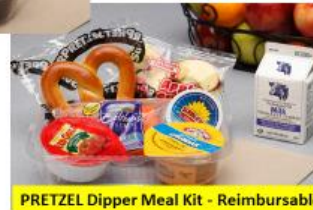
PRETZEL Dipper Meal Kit - Reimbursable

Salsa & Marinara Sauce Red/Orange Veggies That Kids Love to Eat!