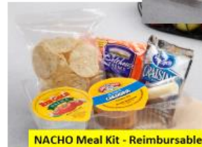
NACHO Meal Kit - Reimbursable